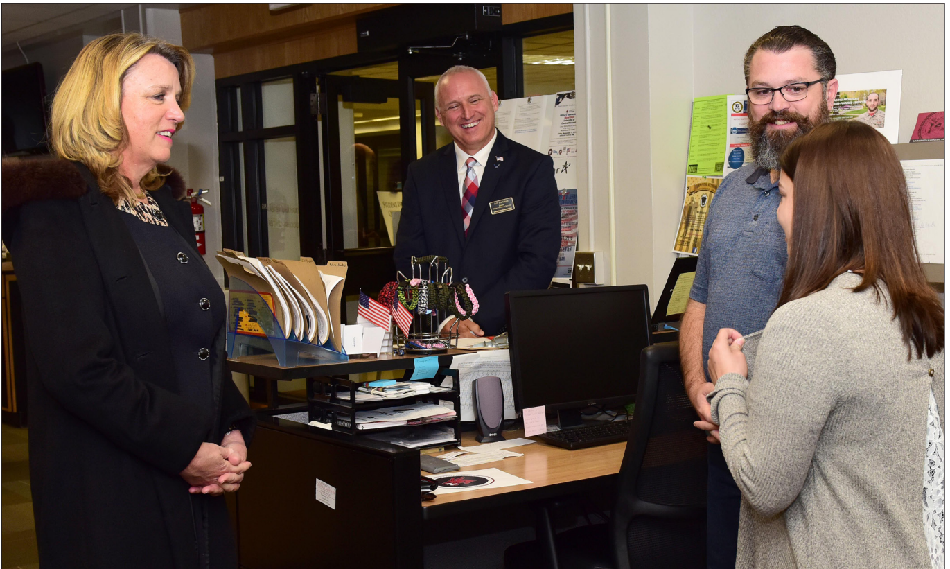
Secretary of the Air Force Deborah Lee James receives a briefing on student-military relations at the University of Central Missouri (UCM) in Warrensburg, Mo., Nov. 7, 2016. James visited the Whiteman Advantage at UCM to learn more about the relationship between UCM and Whiteman Air Force Base.