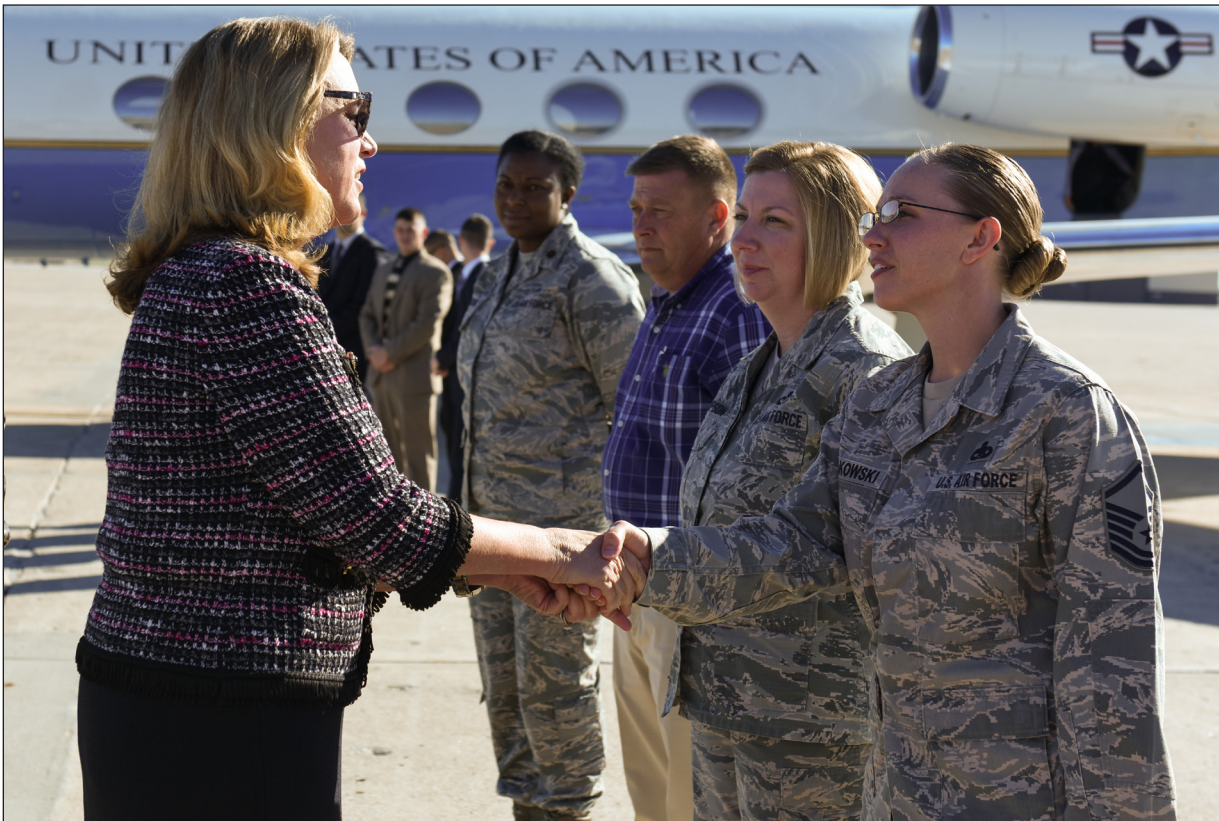
Secretary of the Air Force Deborah Lee James coins members of Team Whiteman who helped organize her visit to Whiteman Air Force Base, Mo., Nov. 9, 2016. James met with Total Force Airmen during her visit to understand how each of the organizations work together to accomplish the overall mission at Whiteman.