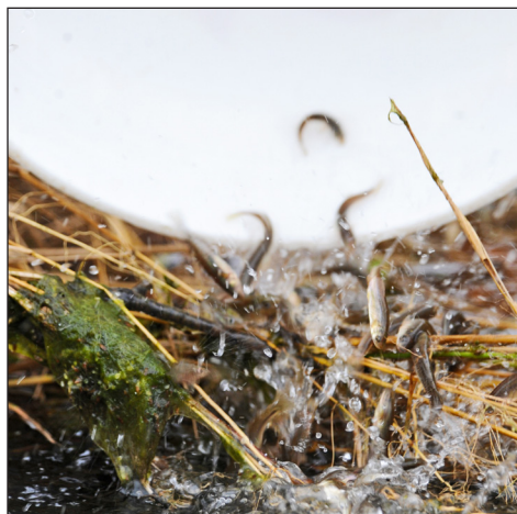
Minnows are released into a base lake by the U.S. Fish and Wildlife Service at Whiteman Air Force Base, Mo., Nov. 2, 2016. Personnel from the Federal Hatchery in Genoa, Wis., restocked all Whiteman lakes to help balance the fishery and provide recreational fishing on base. The restocking came following a Missouri Department of Conservation electrofishing survey conducted on the base lakes this past June.